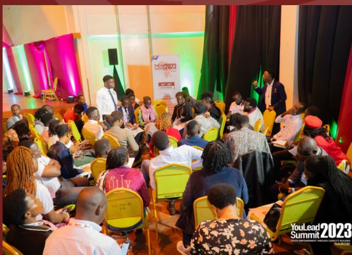
Picture 28. Delegates during Post Summit Agenda group discussions on Day 4 of YouLead Summit 2023.

The final day of the summit was marked by the development of the post-Summit agenda, a critical part of the summit which seeks to garner contributions from delegates for future incorporation in operational and decision making contexts within the EAC and YouLead spaces. Making their presentation in national and pan-African blocs, the delegates' interventions covered four thematic areas - Gender Equality, Climate Justice, Business and Politics. A salient theme of these presentations and the summit overall was the need to move from policy creation to policy implementation.