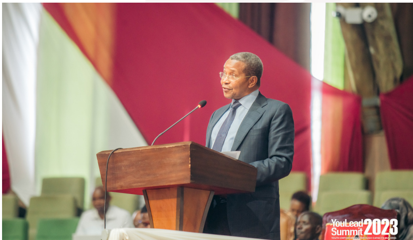
Picture 10. H. E. Dr. Jakaya Mrisho Kikwete, former President of the United Republic of Tanzania and Patron of YouLead during the Presidential Address on Day 1 of YouLead Summit 2023.

H.E Dr. Jakaya Mrisho Kikwete, Former President of The United Republic of Tanzania.