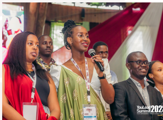
Picture 27. EAC Youth Fellows at YouLead summit 2023