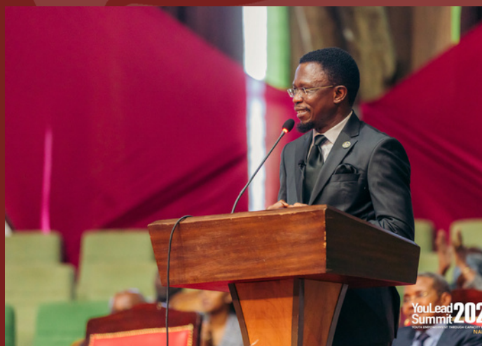
Picture 11. Hon. Ababu Namwamba, Cabinet Secretary of Youth, Sports and Culture of Kenya, during the Presidential Address on Day 1 of YouLead Summit 2023.