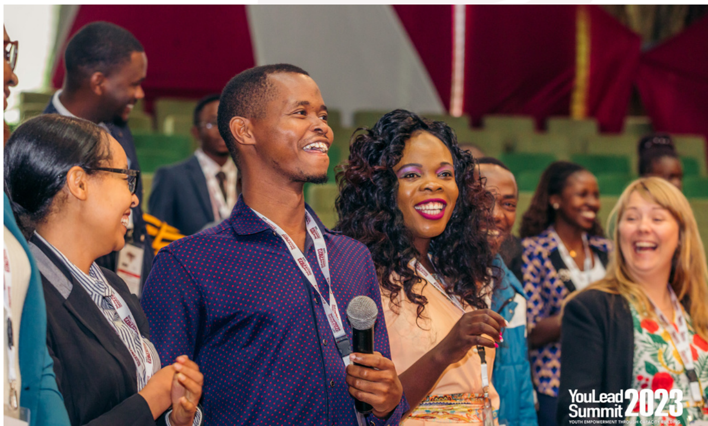
Picture 30. YouLead Summit Delegates during Day 1 of YouLead Summit 2023

We believe in forging partnerships towards meaningful youth inclusion and strategic plans for the Africa we Want, henceforth, we reiterate this precious token of appreciation to our partners and look forward to more sustainable approaches to development.