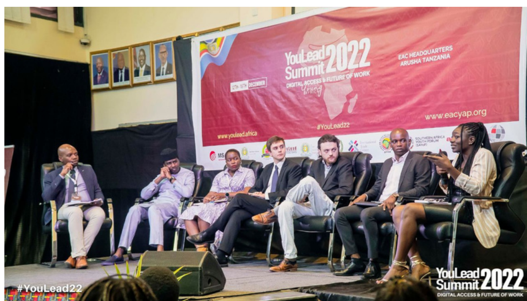
Representatives from both Africa and Europe, including the African Peer Review Mechanism and the Young European Federalists during the Policy Makers and Development Partners Roundtable on day 2 of #YouLead22

The opening session was followed by the Policy Makers and Development Partners Roundtable, a session that was slated from Day I to Day II, which hosted a fruitful dialogue and exchange on Africa-Europe partnership and entry points for young people. The discussion, which hosted representatives from both Africa and Europe, including the African Peer Review Mechanism and the Young European Federalists, tackled the following aspects, namely partnership for green transition and energy, partnership for digital transformation, sustainable development and jobs, peace and governance, and migration and mobility. As a result of the dialogue, it became clear the importance of championing intergenerational leadership to bring young people to the table of key negotiators and involve them in implementation processes.