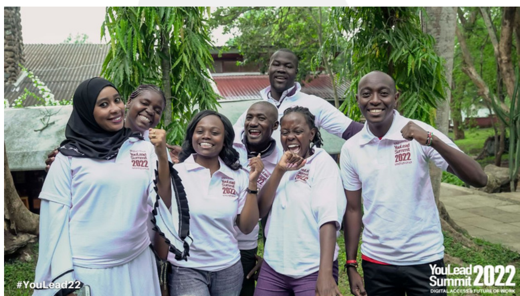
Delegates at #YouLead22

The annual climax of our year of work is YouLead Summit, one of Africa's largest and most diverse forum of young leaders, mentors, government policy makers, development partners, private sector, academia, media and civil society from all over Africa to craft responses to the continent's rapidly growing youth population, their challenges and opportunities.