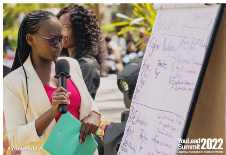
A delegate leading a discussion during the post summit agenda on day 4 of #YouLead22

On day four, the Post-Summit Agenda discussion was hosted to ensure that the life of summit discussions goes beyond the summit reports. The last day, through the Arusha Experience, participants had the opportunity to explore the many features and recreational opportunities that Arusha and its surrounding offer.