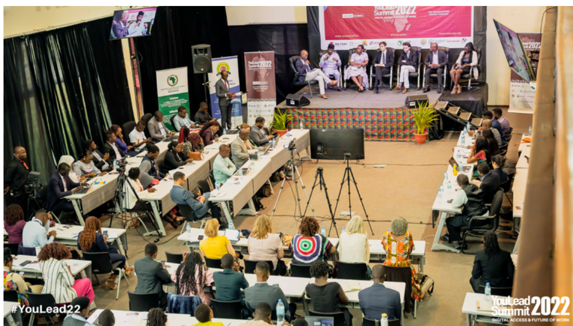
Panel discussion during the Under 40 Business Leaders Forum on Day 2 of #YouLead22 at the EAC Headquarters

YouLead Summit 2022, held under the theme “Digital Access and Future of Work”, featured three main Forums, complemented by evening activities. Day one hosted the Under 40 Political Leaders Forum, which examined the policy and institutional environment and the state of youth participation in political governance, explored factors that help or hold back youth from becoming leaders, and advanced new thinking on what it will take for Africa’s youth to become the leadership for the Africa we want. The Policy Makers and Development Partners Roundtable examined the role of policy makers and development partners in creating an enabling environment for Young People’s Participation. The roundtable examined the relevance of the Africa-Europe Partnership to African youth and how to best make it work for African youth in the areas of digital access, economic opportunities and decent work for youth especially under the AfCFTA.