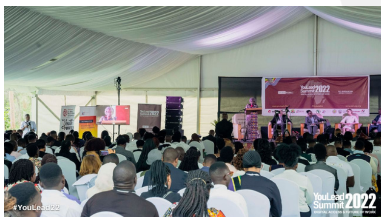
A cross section of delegates during opening remarks on day 1 of #YouLead22

The Summit serves as a forum for the examination of the state of digital transformation and the future of work and aimed at putting forward solution models for a predictable future of decent employment and work opportunities for African youth. The role of policy makers and the private sector in securing a shared future through innovations was prominently featured and a pledging session was hosted for government and private sector leaders to share their commitments to supporting the digitalization agenda for youth employment. Selected case studies from African nations in general were utilized to demonstrate how the digitalization agenda has worked as a tool for economic transformation and development in general.